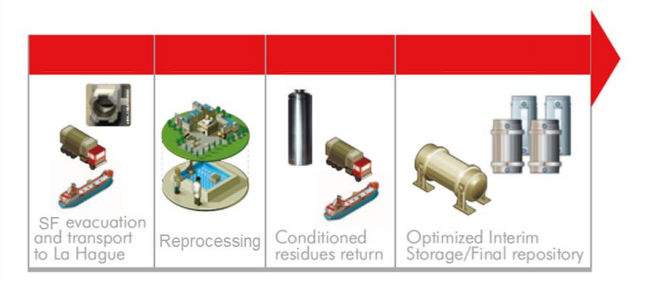
Fig 3. Timeline of the reprocessing project execution phase

This overall timeline is described in the Fig. 4 below and is 10 to 40 years long depending on the reprocessing scenarios and the concluded IGA.